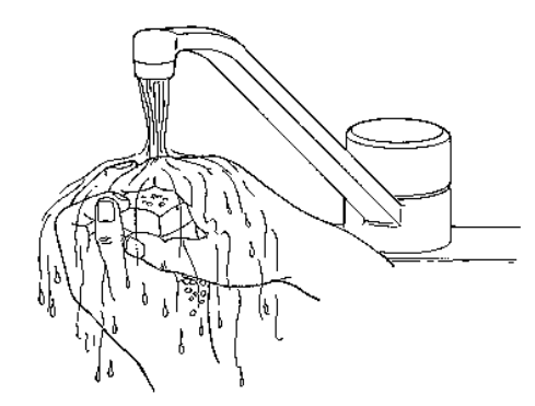
The scrubbing with soap takes the germs off your hands.