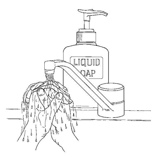
One of the best things you can do to prevent infection is to wash your hands well and often.