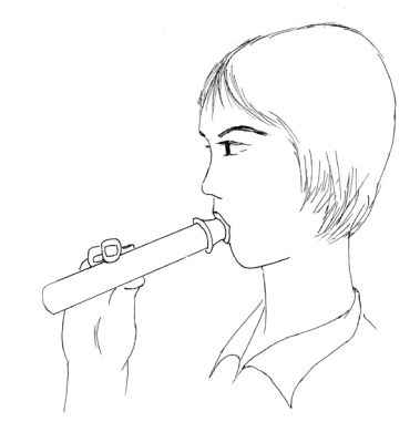
Blow hard and fast.