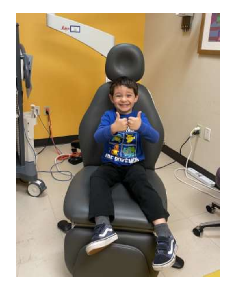
You did it!

A scope can be really fast – just a minute or two! After the doctor sees the inside of your nose and throat, they will gently slide the tube out.