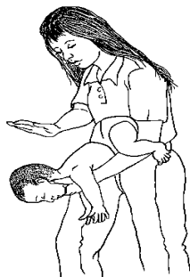
Step 1: 5 back blows

Repeat steps until your baby passes out or object comes out.