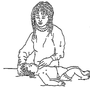
Check baby's mouth for object