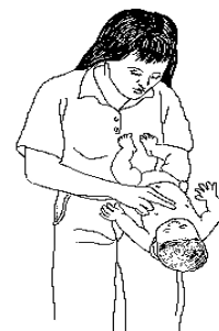
Step 3: 5 chest thrusts