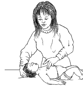
Give 30 chest pushes.