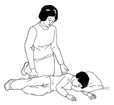
Place the child on something soft, or the floor.