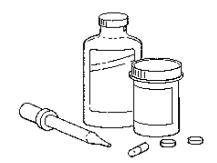
As the child grows, the dose or type of medicine may change.

Some triggers may cause a person with epilepsy to have seizures, even if he or she takes medicine regularly. These triggers are: