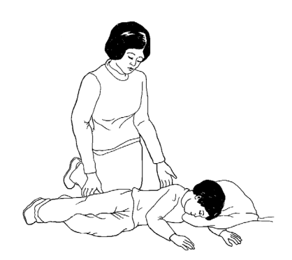
Most seizures last less than five minutes.

A child with epilepsy has many seizures, which are not caused by body chemistry being out of balance. A child who has one or two seizures may not have epilepsy, but a child with epilepsy has seizures.