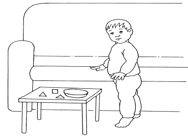
Children learn how to walk when they hold on to sturdy furniture and move around a room.